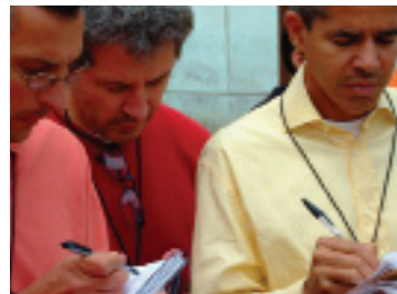
Reporters on PSI prison visit

Peter Piot attracted over 200 guests. Speakers included Health Minister José Angel Cordova, Rep. Barbara Lee and Dr. Piot.